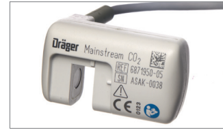
Mainstream CO 2 sensor for Evita® Infinity® V500, Savina® 300 Select and Savina® 300 Classic

– The patented design of the disposable CO 2 cuvette delivers the same performance as the reusable type, but without the additional cost of time consuming sterilization protocols.